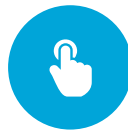
Technology Strategy Development

Our Fractional CIO service provides expert technology leadership on a part-time basis. We help you assess and develop a comprehensive technology strategy that aligns with your business objectives. From managing IT vendors to optimizing your technology investments, we provide the leadership you need to scale your IT infrastructure efficiently without the high costs of a full-time CIO.