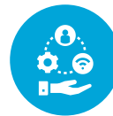
Vendor & Budget Management